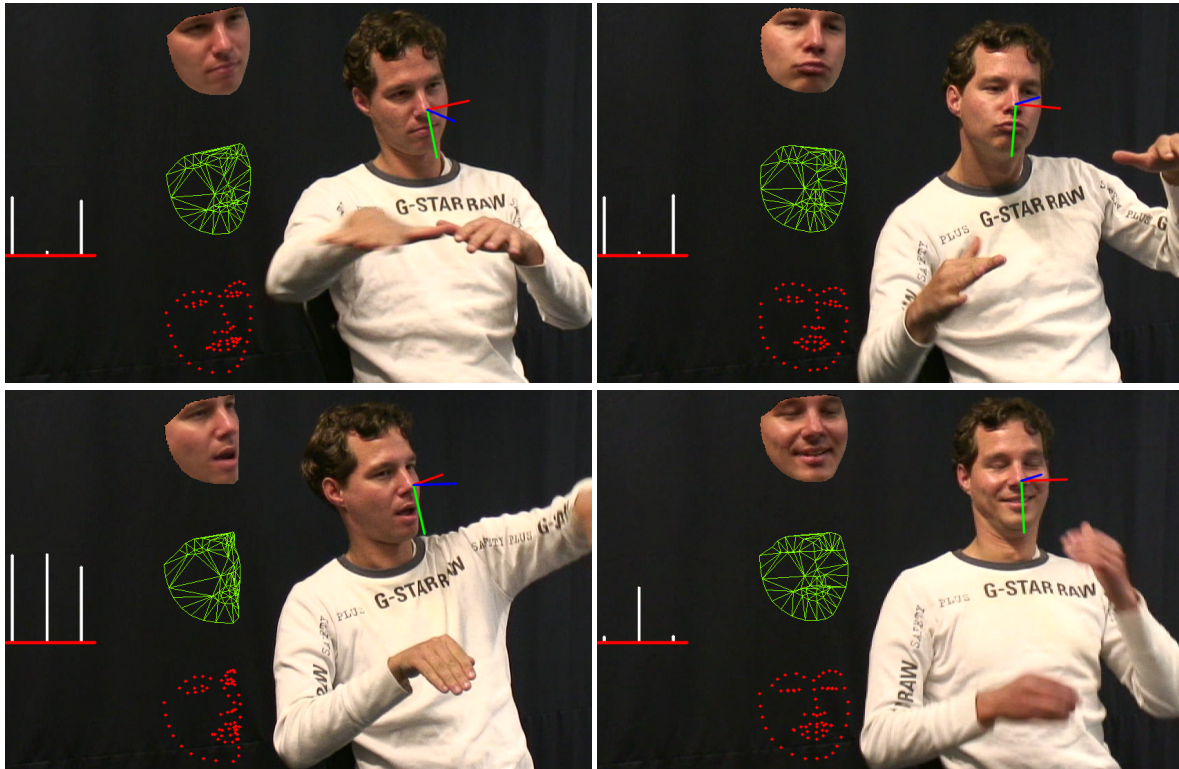
Figure 3: Facial feature extraction on the Corpus-NGT database (f.l.t.r.): three vertical lines quantify features like left eye aperture, mouth aperture, and right eye aperture; the extraction of these features is based on a fitted face model, where the orientation of this model is shown by three axis on the face: red is X, green is Y, blue is Z, origin is the nose tip.