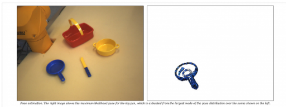
Pose extraction. The right image shows the maximum-likelihood pose for the toy pan, which is extracted from the largest mode of the pose distribution over the scene shown on the left.

Object appearance – mainly color – is modeled by searching for clusters in the object appearance domain, then defining a different edge distribution for each color. The object model effectively consists in a Markov network containing one latent variable that represents the object pose, and a set of latent variables for the edge densities described above. Edge densities readily allow one to compute the 6DOF pose distribution of an object within an arbitrary scene by propagating scene evidence through the model. Pose inference is implemented with generic probability and machine learning techniques – belief propagation, Monte Carlo integration, and kernel density estimation.